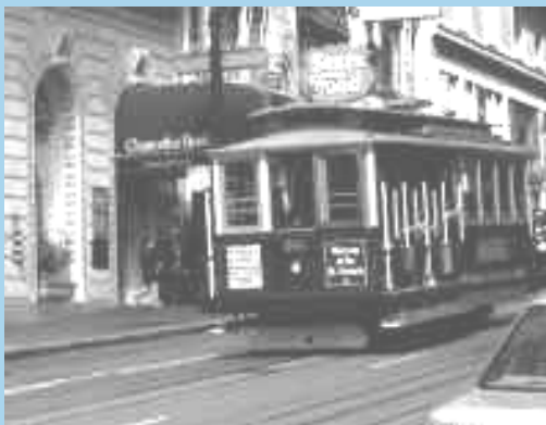
NRTA's Leadership Conference in San Francisco August 14–16, 2005

Copies of this information can be available to individual chapters at their request through the REAM state office.